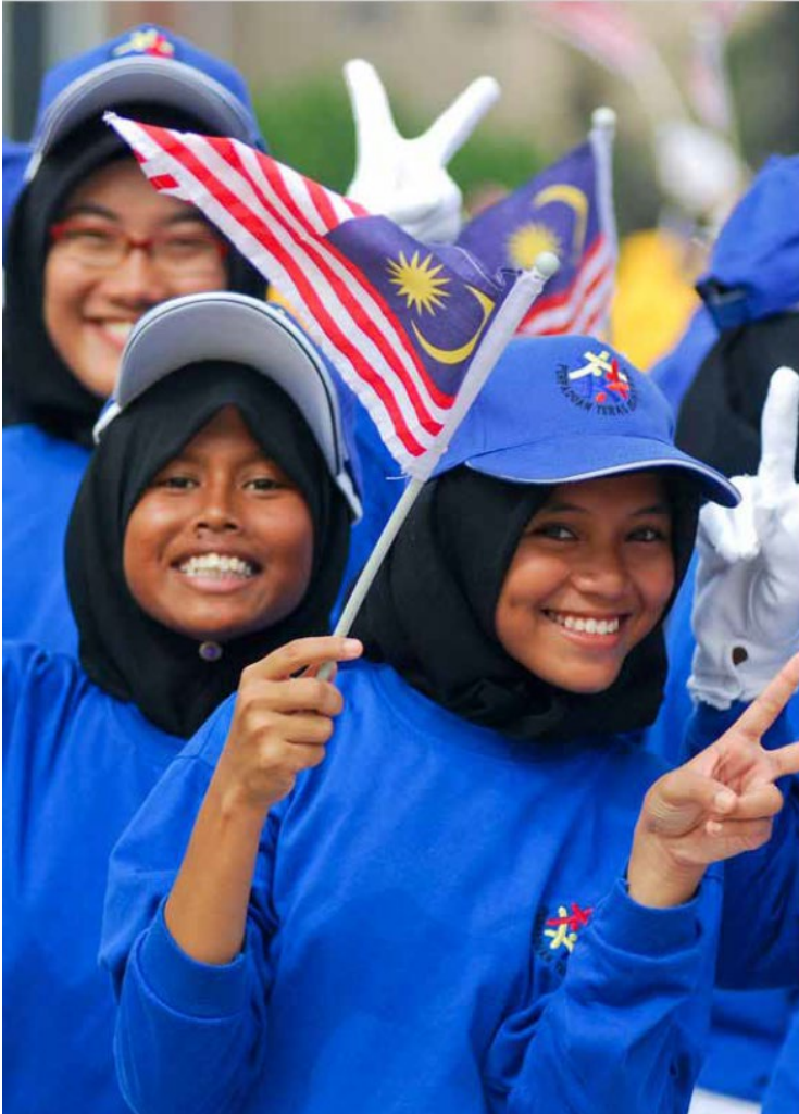
Malesian mahdollisuudet koulutussektorilla