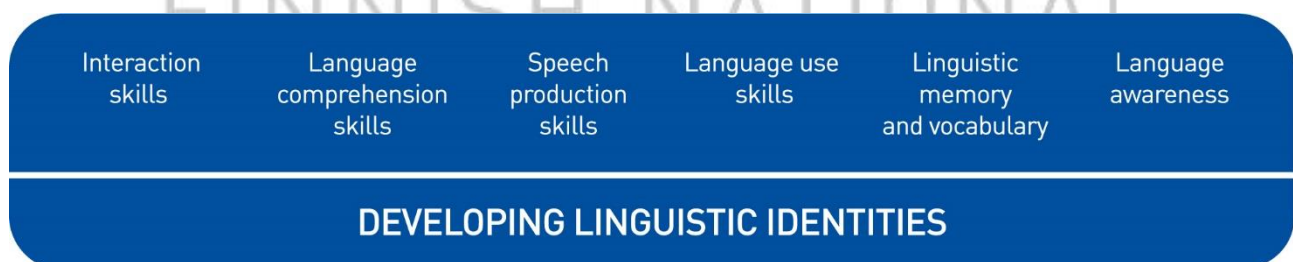
Figure 2. The main areas of children's linguistic development in early childhood education and care

It is important for language learning to acknowledge that children of the same age may be going through different phases in different areas of linguistic development. Linguistic identities develop as children are provided with guidance and support in the main areas of linguistic skills and capacity.