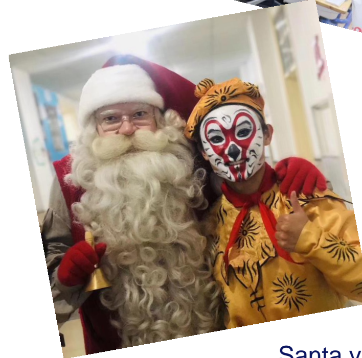
15 Team Building