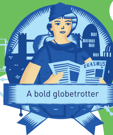
A bold globetrotter