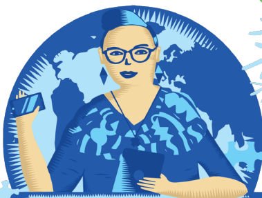
An inquisitive all-rounder

for students in upper secondary education