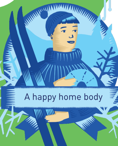
A happy home body