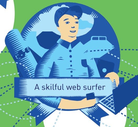
A skilful web surfer